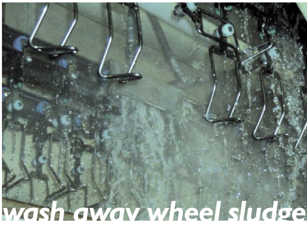
wash away wheel sludge