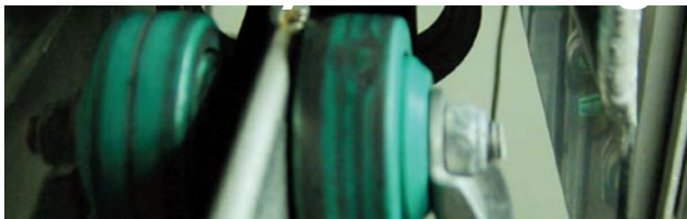
The MandM Trolley Wheel Washer is currently available for both Tee Rail and 3" I-Beam track.

Sludge, gunk, grime and grit. There are several ways to describe it, but despite all technical terms, this foreign material can cause big problems when left to accumulate on your wheel bearing areas.