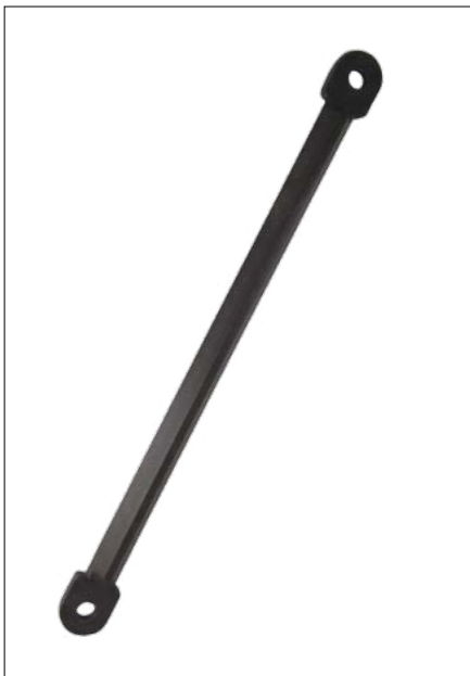
#1457 12.5" Drop rod