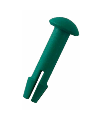
#1455 Four-prong pin.

At M&M Poultry Equipment, we believe that a price tag shouldn't determine the quality of a product. That's why each part of our replacement for the Meyn* shackle undergoes rigorous quality testing, including dimension accuracy verification and even X-ray inspection to assure minimum gas voids in production. And as for the price, it's so low, we couldn't print it on this flyer.