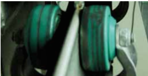
Fig. A: Wheel "gunk."