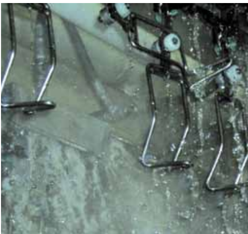
Fig. B: High velocity pressure washer on track line.