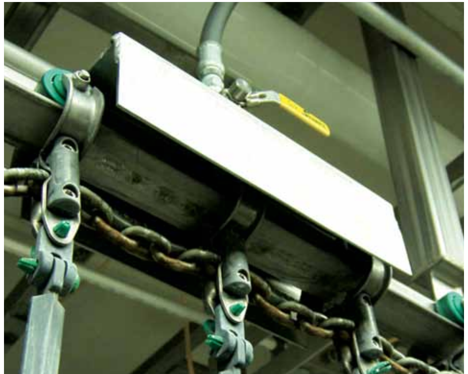
Fig. B: M&M Poultry Trolley Wheel Washer.